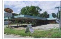
Year-old plan for former A&W site on Ellis Blvd. N...