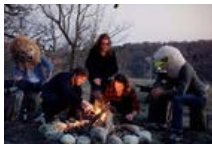
Empires September 27, 6:00PM @Blue Moose Tap House