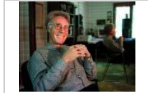
Noted Cedar Rapids composer, conductor dies