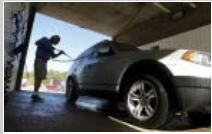
Sales tax exemptions bite into Iowa coffers