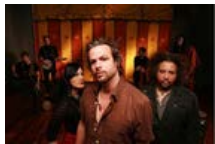
Rusted Root + Lucy Stone + Chasing Shade September 26, 7:00PM @Gabes