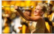
New University of Iowa Golden Girl ready to shine