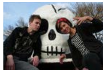
Matt & Kim + Grand Funk Railroad September 28, 7:00PM @The Pentacrest