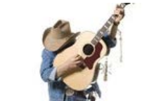
Dwight Yoakam September 28, 8:00PM @Harrah's Council Bluffs Casino and Hotel